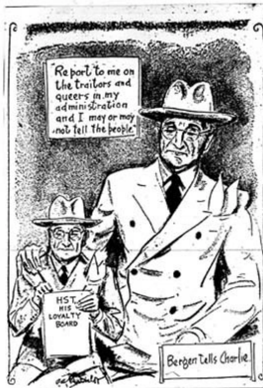
A cartoon of President Truman in the Washington Times-Herald

The Federal Loyalty Review Board passes the buck to President Truman. They agree that the president should decide if a homosexual or alcoholic should be considered a security risk. The press latches onto this, criticizing the move. It seems that now, if Truman doesn't fire homosexuals, he would be seen as a protector of security risks. And if he does fire them, Congress would demand to know how they ended up working for the government anyway. Either way, Truman's administration would be seen as incompetent in this regard.