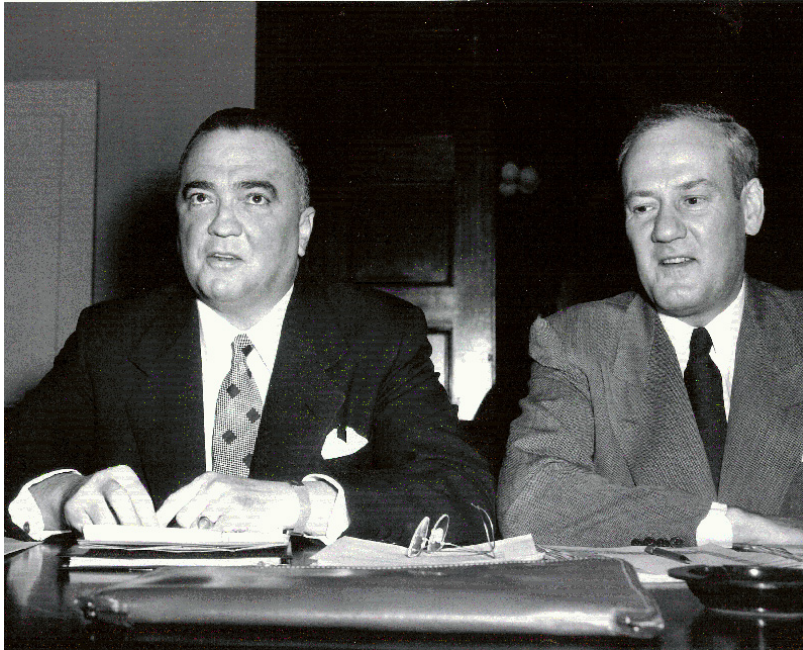
Hoover and Tolson